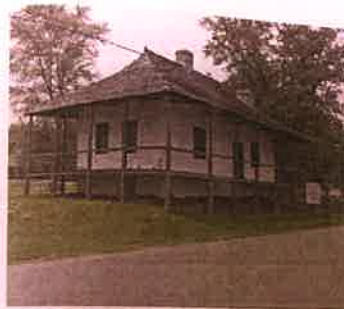
The recently restored Benjamin Hildner House built in 1808 is one of just five vertical log "shotgun-style" homes — or both in-ground — buildings left in the country.

Roy Blunt, a Republican, represents Missouri in the United States Senate. ■