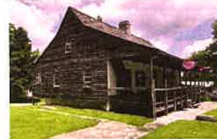
AMOUREUX HOUSE at Ste. Genevieve National Historical Park in Missouri.

This fall, the National Park System formally welcomed the Dwight D. Eisenhower Memorial in Washington, D.C., the Mill Springs Battlefield National Monument in Nancy, Kentucky, and the Ste. Genevieve National Historical Park in Ste. Genevieve, Missouri, bringing the grand total of National Park Service sites to 422. The memorial, a 4-acre park adjacent to the National Mall, recognizes the contributions of Eisenhower, the commanding general of the Allied forces in Europe during World War II who went on to become the nation's 34th president. Designed by architect Frank Gehry, the memorial features sculptures of Eisenhower at different stages of life and is anchored along its southern border by a 450-foot metal tapestry depicting the cliffs of Pointe du Hoc in Normandy, the site of a critical battle during the Allied invasion of Europe in June 1944. While Congress authorized the memorial's creation in 1999, progress was delayed by design disputes and a lengthy approval process, and the